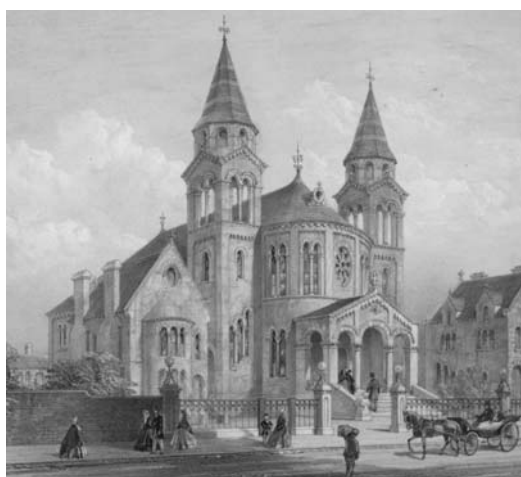
Abbey Road Baptist Church

Aeon Baptist Chapel, Church Street, St Marylebone Marriages 1927-1940