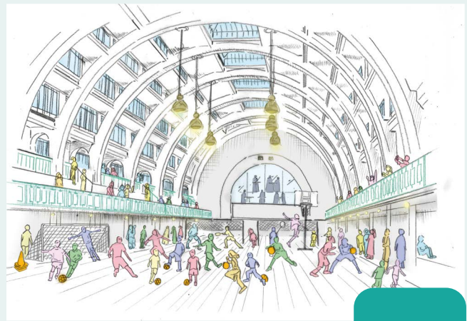
Sketch image of the new sports hall