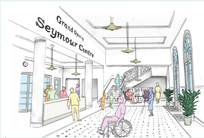
Sketch image of the new reception area