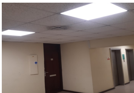
Hide Tower New Lighting

For out of hours emergencies relating to our work please call: 01322 660226