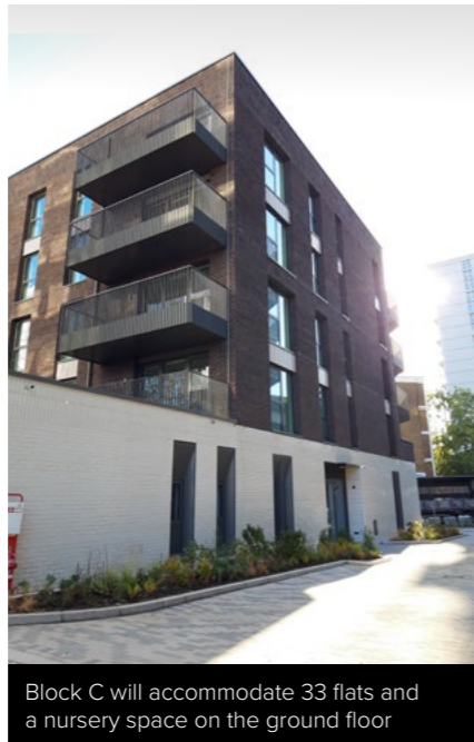
Block C will accommodate 33 flats and a nursery space on the ground floor