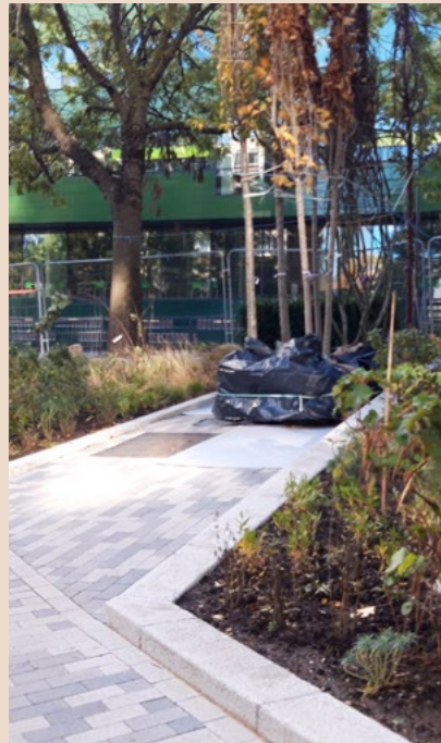
Paving and landscape area surrounding the new blocks and Harrow Road