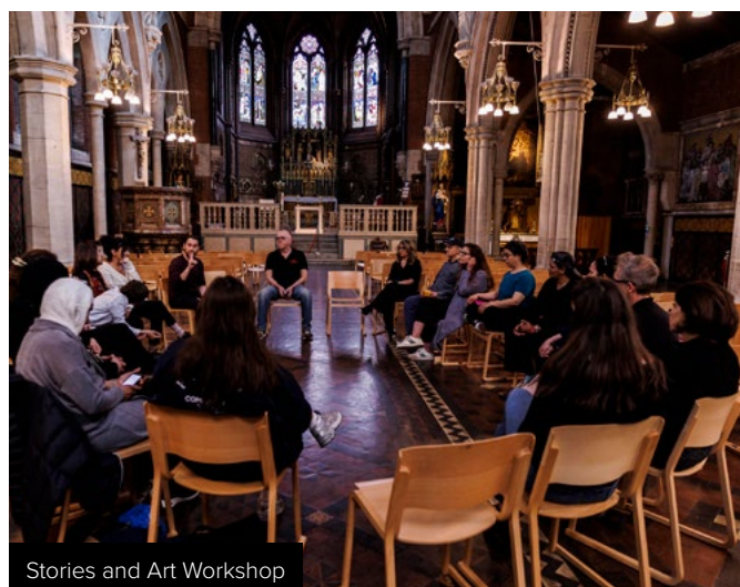
Stories and Art Workshop

For a full programme and to book your tickets visit www.grandjunction.org.uk/events