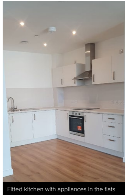
Fitted kitchen with appliances in the flats