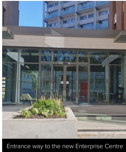
Entrance way to the new Enterprise Centre

The finishing touches are being made to 300 Harrow Road this month and it will soon be ready for residents to move in. Here are a selection of images from the project.