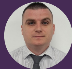
Costi Senior Site Manager