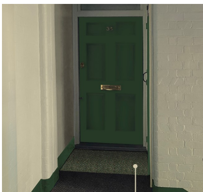
Option 1: Green

Please would you be kind enough to complete the form and return this in the pre paid envelope provided. The winning colour combination for each building will be displayed by way of a poster in your block. Please see below colour choices.