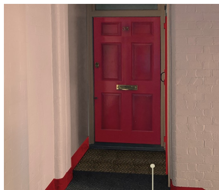
Option 2: Red