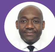
Snr. Site Manager