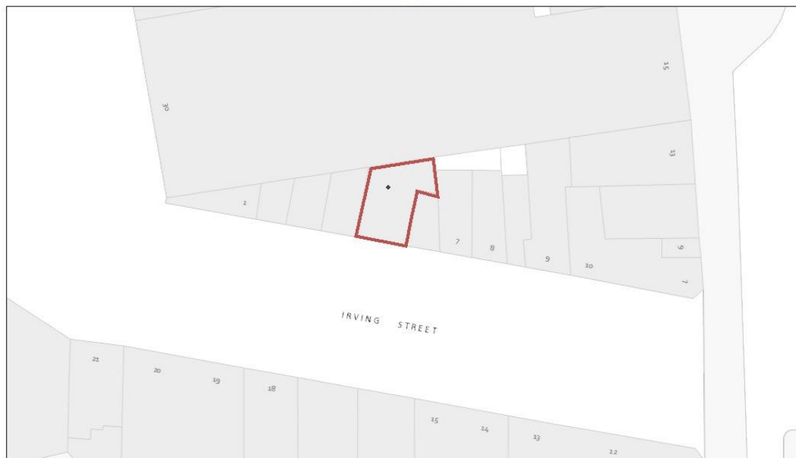
5 Irving Street