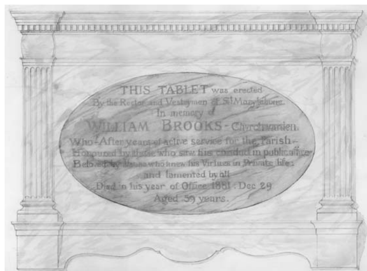
Watercolour of memorial tablet in St Marylebone church