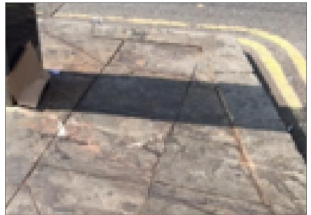
Examples of dirty pavement on corner of Brompton Road and Montpelier Street