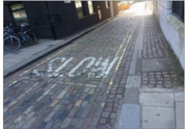
Road painting on cobbles should be consistent