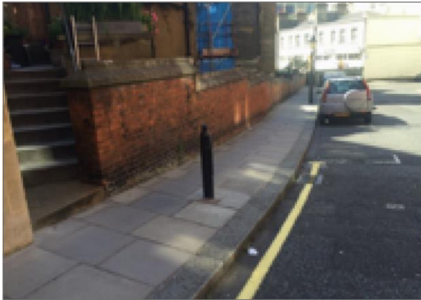
Old street light lamp post stump should be removed

the achievement of many of the 17 Sustainable Development Goals (SDGs) within the United Nations' 2030 Agenda for Sustainable Development 1 .