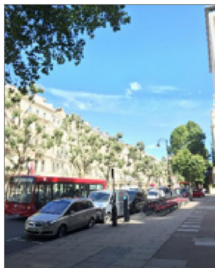
Potential to double cycle hire space near Imperial College London