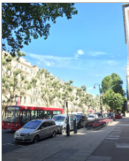
Potential to double cycle hire space near Imperial College London