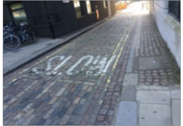
Road painting on cobbles should be consistent