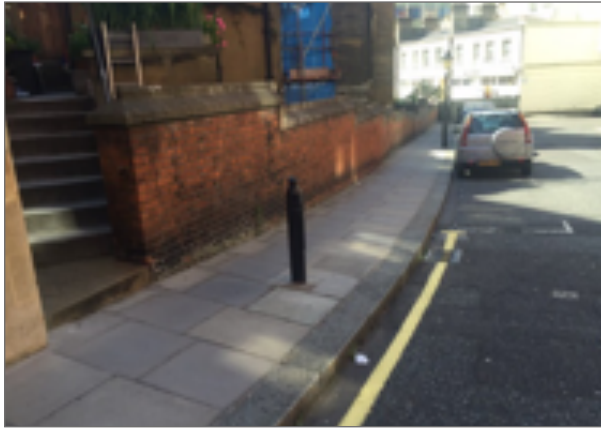
Old lamppost stump should be removed

2.5 The actions, along with the lead partners and proposed timescales are detailed in Appendix A. The Forum has also identified where these actions can contribute to the achievement of many of the 17 Sustainable Development Goals (SDGs) within the United Nations' 2030 Agenda for Sustainable Development 1 .