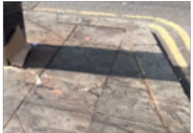
Examples of dirty pavement on corner of Brompton Road and Montpelier Street