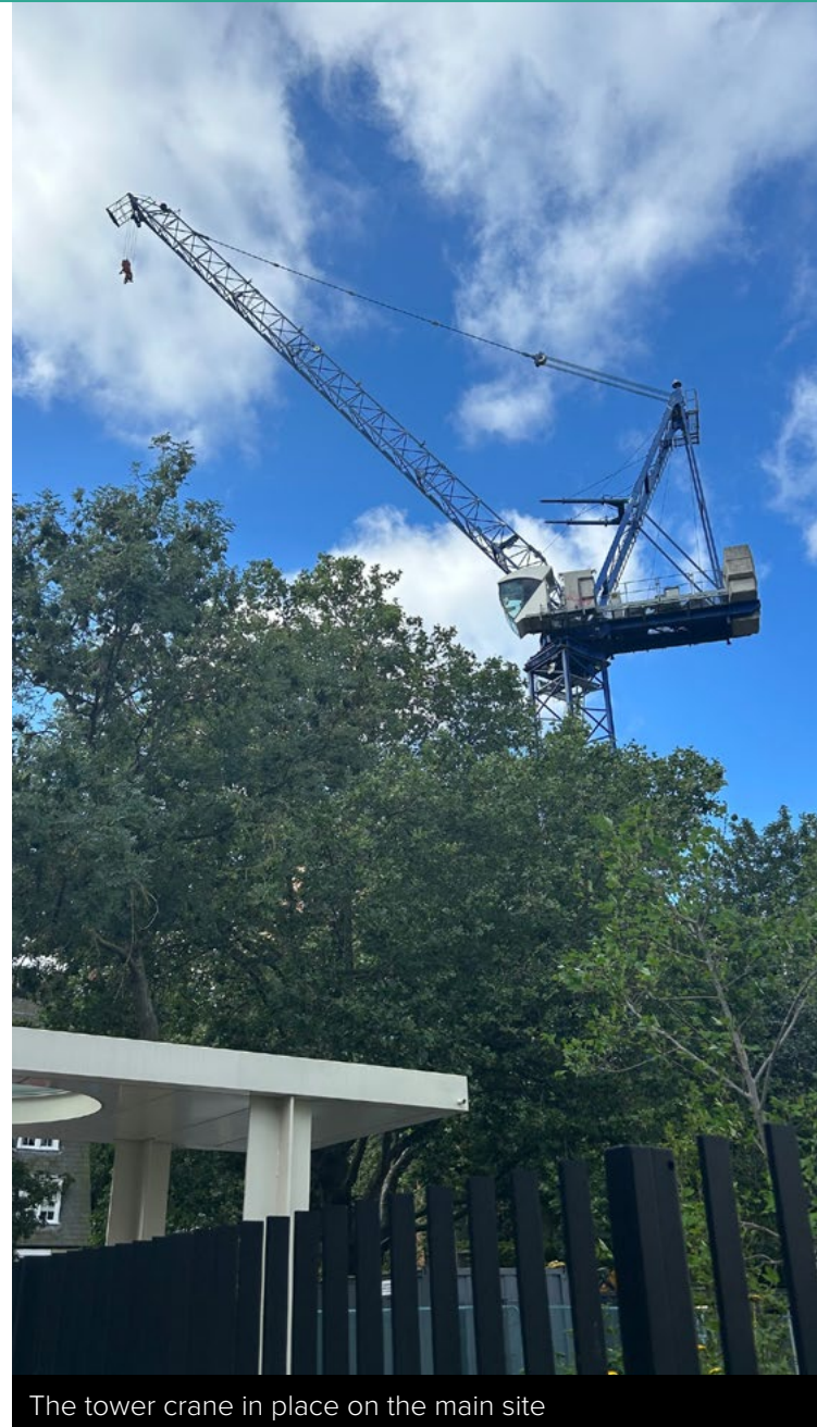
The tower crane in place on the main site

The railing panels to the new pedestrian entrance have now been installed and soft landscaping to the street facing area has been completed. Due to the exceptionally hot weather in June, the conditions were too dry to lay the grass turf, so this has been rescheduled for the coming weeks. The brand-new vehicle gate is in situ and will be connected and fully functioning imminently. Luxborough Tower residents will receive further information about this directly.