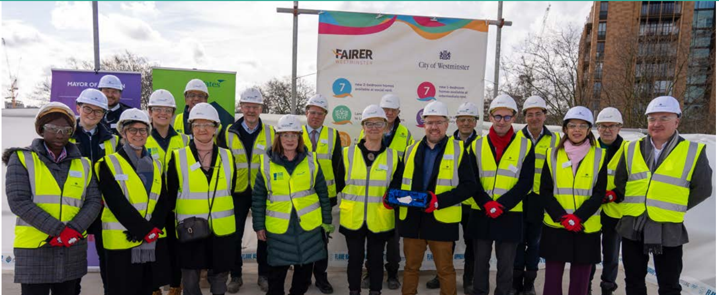
Our brand new mixed-use affordable housing scheme is nearing completion.

Construction of 14 New Homes Progressing well Luxborough Tower Gardens Landscaping Update Delivering a Fairer Westminster Faces of Westminster Plus much more!