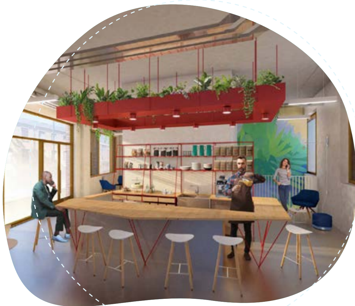
*GGI of proposed Church Street Triangle interior

A new 6,400 sq. ft. workspace at 300 Harrow Road is part of a mixed-use development. It will offer affordable space for small and start-up creative businesses, aligned to the North Paddington CEZ vision. We are currently out to procure a best-fit space operator.