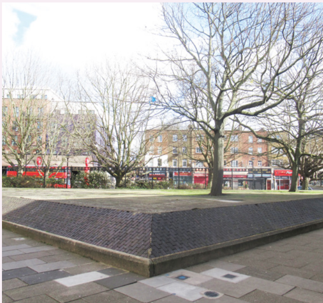
Current podium in front of Parsons House

These works are due to be completed by summer, just in time for you and your family to enjoy the newly created seating area surrounded by new greenery. This area will be accessible by stairs and a ramp.