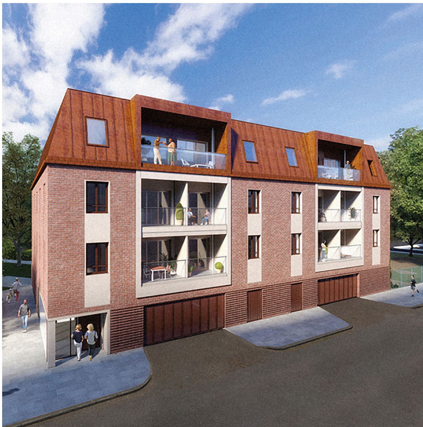
Image created by DMA architects of new homes