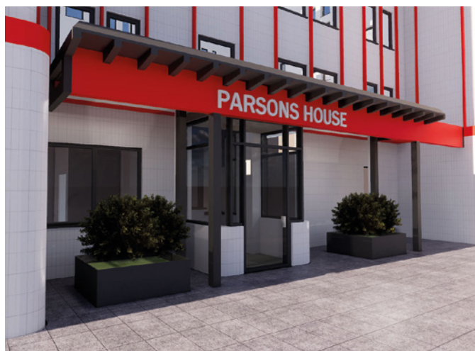
Artist's impression of New Parsons House entrance

Improvement works for Parsons House will be beginning soon. These will consist of building a new entrance for Parsons House, remodelling the internal lobby area to create a welcoming space and building a brand new Residents' Room for the community to enjoy.