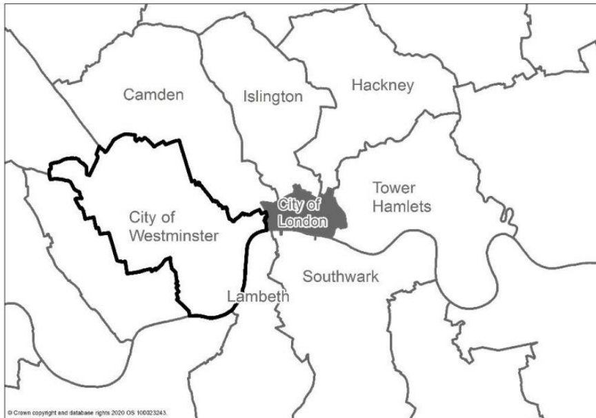
Figure 1 The boundary of the City of London and the City of Westminster

2.1.1 The SoCG covers the Local Planning Authority areas of the City of London and City of Westminster. The boundaries are showing on figure 1.